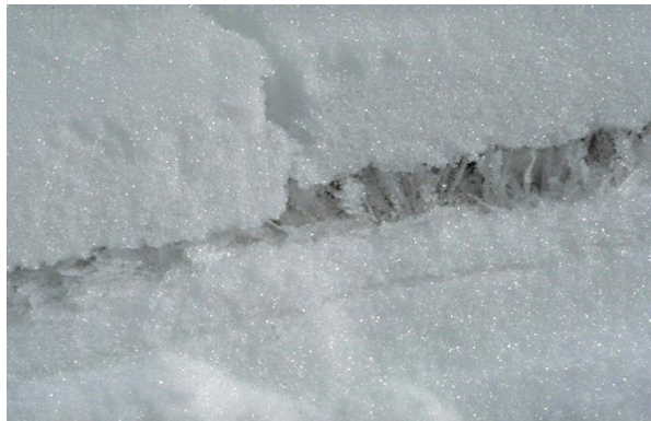
Fig. 3: This photograph of a collapsed surface hoar layer is probably the most influential and has triggered many ideas and debates over the last 15 years (from Jamieson and Schweizer 2000).

Hence, under most conditions snow failure under mixed-mode loading is due to shear failure. However, when considering the microstructure of snow, high local stress concentrations may occur (Schneebeli 2004) leading, e.g., to tensile failure. In other words, at the scale of bonds, any failure mode seems possible (Schweizer and Jamieson 2008). In this context, it is important to note that the collapse of weak layers that is observed after failure follows from the structural damage in the highly porous microstructure of weak layers during crack propagation (Figure 3). Collapse is not a failure mode but a consequence of failure. The fact that there is vertical displacement does by no means imply that there was a compressive failure 1 .