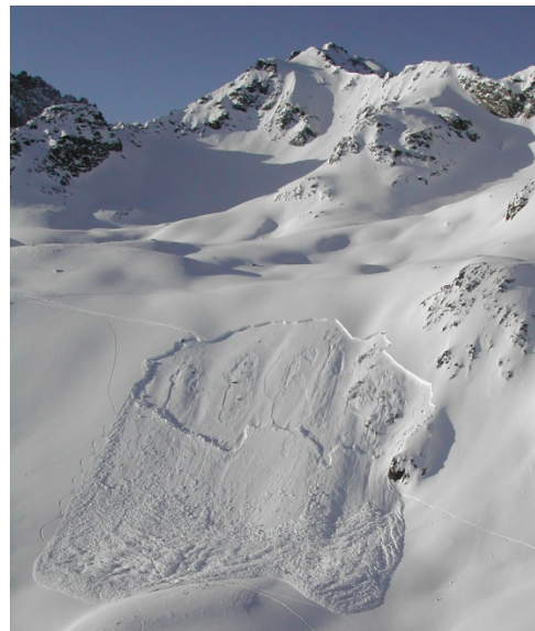
Fig. 1: Dry-snow slab avalanche

following only focus on the formation of this type of avalanche (Figure 1). Such avalanches result from a sequence of fracture processes including (i) failure initiation in a weak layer underlying a cohesive snow slab, (ii) the onset of crack propagation,